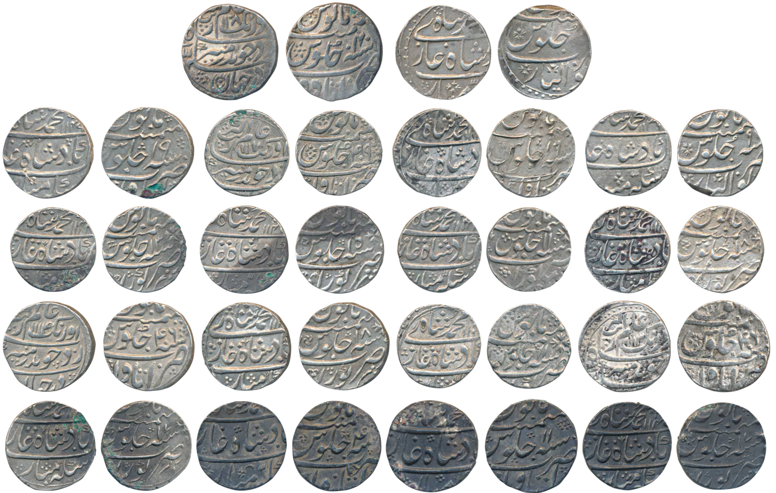
50 Muhammad Shah, Silver Rupee (18), Gwalior Mint (2); Itawa Mint (4); Kora Mint (8); (KM 436.29 & 436.39); Aurangzeb, Itawa Mint (4) (KM 300.39). Very Fine to Extremely Fine. (18) Estimate: ₹ 50,000-60,000