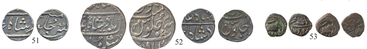
51 Ahmed Shah Bahadur (AH 1161-1166; 1748-1754 AD), Silver ½ Rupee, 5.67g, Surat Mint (off flan), RY Ahd, (KM 444.3). Extremely Fine, Rare. Estimate: ₹ 3,000-4,000